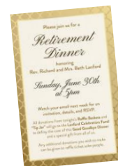
Details – page 3