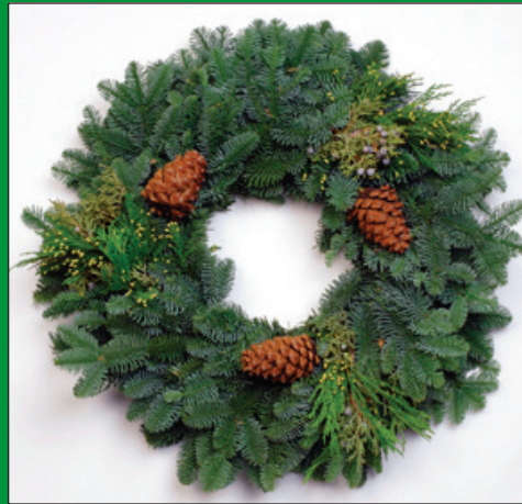
Noble Fir Mixed Wreath 20" Indoor/Outdoor

Single Face Balsam Outdoor Wreath 24", 30", 40" Double Face Balsam 36"