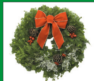
24" Boxed Decorator Wreath