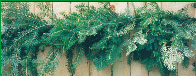
25' Balsam Fir Garland