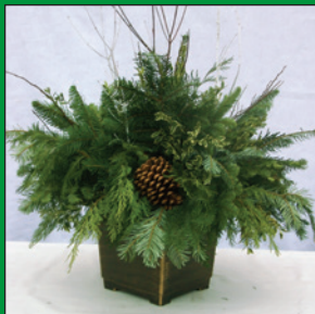
32" Evergreen Planter 42"+ Evergreen Planter