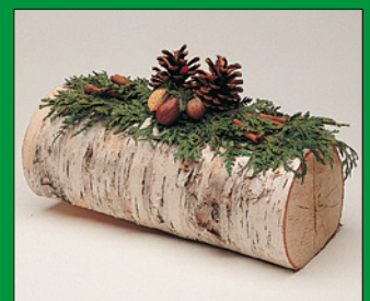
Holiday Yule Log 12"