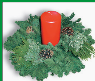
12" Candle Ring Wreath WITHOUT Candle