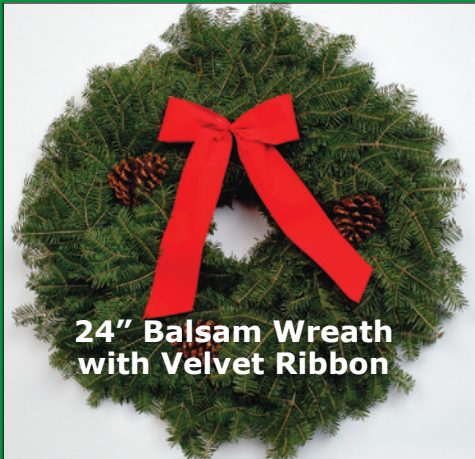
24" Balsam Wreath with Velvet Ribbon

Single Face Balsam Outdoor Wreath 24", 30", 40" Double Face Balsam 36"