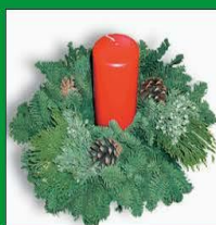
12" Candle Ring Wreath with 4" Candle