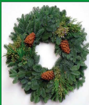
Noble Fir Mixed Wreath 20" Indoor/Outdoor

Single Face Balsam Outdoor Wreath 26", 36", 48" Double Face Balsam 36"