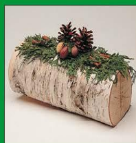
Holiday Yule Log 12"