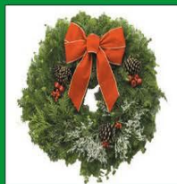
24" Boxed Decorator Wreath