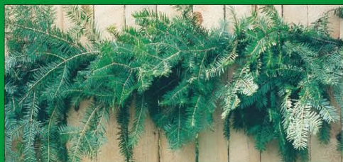
25' Balsam Fir Garland