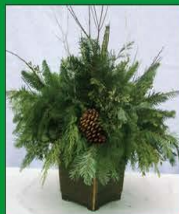
32" Evergreen Planter 38" Evergreen Planter